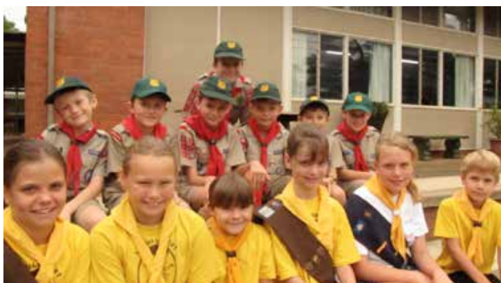
1st Hillcrest cubs and brownies in uniform at Winston Park Primary school.